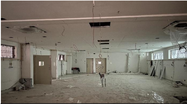
Female recovery room