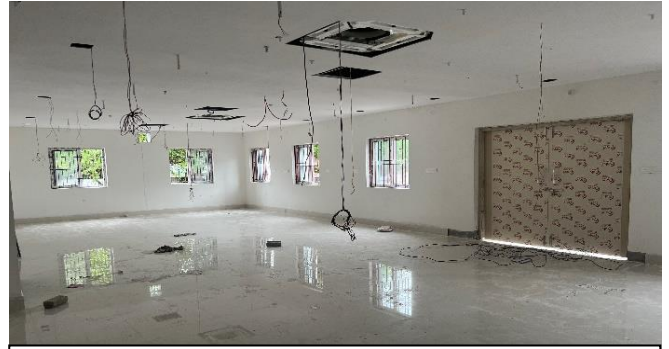
Interior female surgical ward