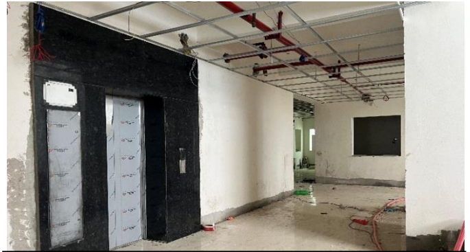
Photographs of progress August 2022