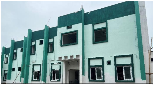
Front view of the hospital