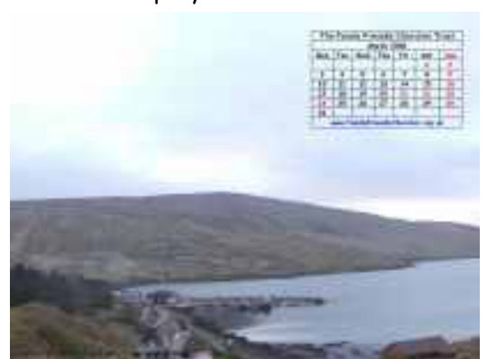
Voe, on the Shetland Islands.

Book the above at www.familyfriendlychurches.org.uk/mpdspec.htm